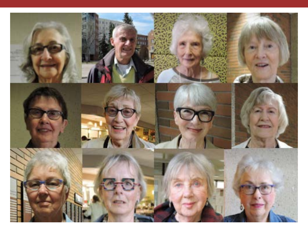
Twelve of this year's attendees also attended ELLA Spring Session the first year it was offered, in 2001!